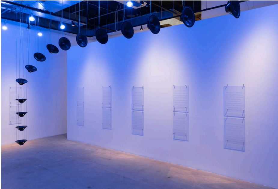
Installation view of Still Life No. 3 , 2015, Raven Chacon

The disruption of linear history is introduced in Still Life No. 3 (2015), a sound installation that takes command of the Swiss Institute's first-floor gallery. Speakers are fastened to the ceiling in a downward curve, and from them come the Diné Bahane story of creation, featuring the emergence of people from four worlds below into the current world. The story, delivered aloud in a woman's voice, plays multiple times at once using a stereo delay unit. The echoes cross one another, mimicking the repeated and intertwined segments of the story itself, muddling chronological sequence and enabling the mutual influence of multiple temporal perspectives. The story is transcribed in both English and Navajo on glass panes circling the room, without clear demarcations of start or end. They can be read by shadows of the engraved but otherwise invisible text on the glass, cast at different angles from a coloured light. While foregrounding a tradition of oral history, Still Life No. 3 offers a multiplicity of ways to process information through different orientations and sensory experiences.