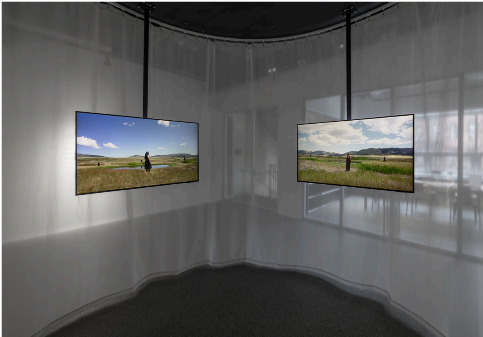
Field Recordings , 1999, Raven Chacon

On the walls of the Swiss Institute's top floor is a series of listening stations dedicated to the oldest of Chacon's work on view, Field Recordings (1999), which glean, amplify, and loop ambient noise from specific locations in the American Southwest, each with a relationship to the Navajo Nation, yet chosen by the artist for their reputation of quietness. The presumed lack of habitation in these areas, the conflation of silence with emptiness, is turned on its head by these blaring sonic artefacts—acknowledging that the land itself has a sound independent of its occupants. Chacon builds further on the acoustics of landscapes in his video installation For Four (Caldera) (2024), inviting us to stand in the centre of a veiled structure surrounded by four screens. Each screen flashes alive in sequence to show four people singing improvisationally on opposing ends of a volcanic hollow. Their voices encircle and mesh and the camera slowly revolves in imitation of their layered sounds, which makes for an eerie sirening effect, not unlike the wind making rounds in a rocky valley. As in other of Chacon's works, For Four aligns performers in a responsive, synchronous relationship with one another and their environment. The camera's seamlessly oscillating point of view makes this work feel particularly present, drawing us into its active system of relation.