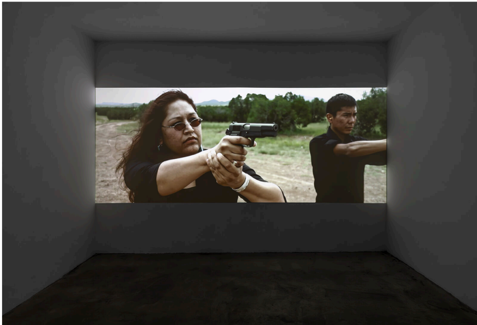
Installation view of Report , 2015, Raven Chacon