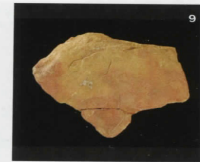
5. Mike Nelson, The Asset Strippers (detail), 2019, mixed media. Installation view, Tate Britain, London. 6. Olga Balema, 8. 2019, elastic band, paint, glue, nails, staples. Installation view, Bridget Donahue, New York. 7. Eric Wesley, Untitled (light rocks) , 2019, mixed media, 75 x 16 x 16". 8. Shahryar Nashat, Keep Begging , 2019, HD video on LED wall, color, sound, 11 minutes 10 seconds. Installation view, Swiss Institute, New York. 9. Horse figure, ca. 13,000 BP, limestone, 11 x 9 1/4 x 2 1/4". From "Préhistoire: une énigme moderne." (Préhistoire: A Modern Enigma). 10. Tony Cokes, 3# 2001, video, color, sound, 3 minutes 50 seconds. Installation view, Goldsmiths Centre for Contemporary Art, London.

6 OLGA BALEMA (BRIDGET DONAHUE, NEW YORK) What is the least amount of art that can constitute a work? Balema's exquisite and scanty show "brain damage" proposed an answer. Composed from elastic bands, staples, and nails, the spread of thirteen pieces resembled a deteriorating set of intersecting grids. Reducing art to the bare minimum, the exhibition tiptoed the line between artwork and its absence.