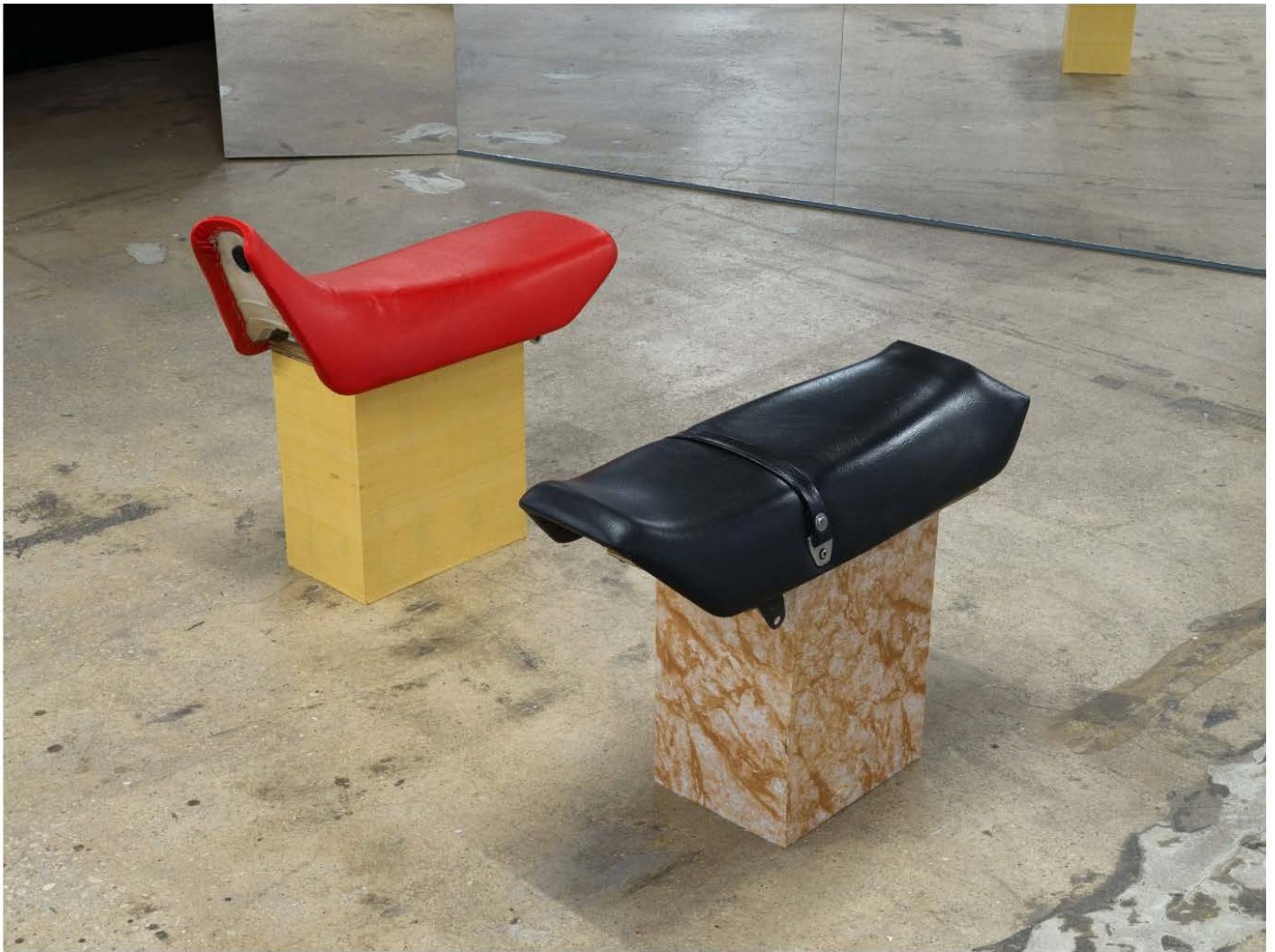
Installation view of Domestic News .

In an installation composed mainly of text from others, the artist's own personal notes are subtle, but present, with details such as the classic springtime anthem "Gong Xi," along with the flower arrangements intermittently appearing on a billboard in the stairwell, alluding to the memoirs of the artist's grandmother who lived through the Second Sino-Japanese War. Also in evidence is the artist's background in architecture and ongoing inquiries into public and private space.