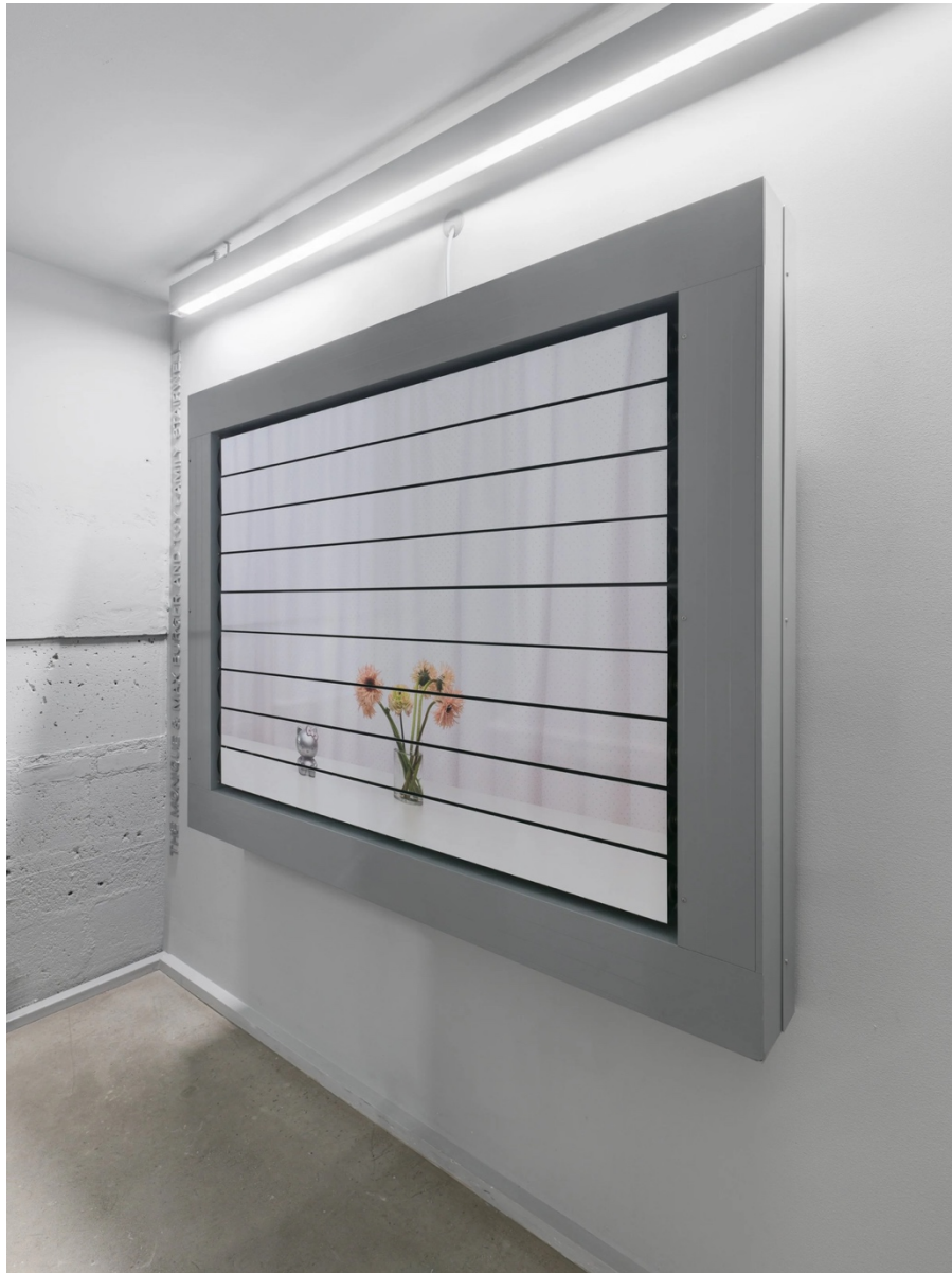
Installation view of Domestic News .

Jiajia Zhang: Domestic News at Swiss Institute, New York. Curated by Alison Coplan, on view through Apr 29— Jul 5, 2026