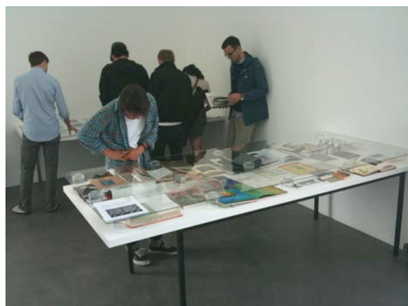
The Dor installation at Kunsthalle Zurich 2009